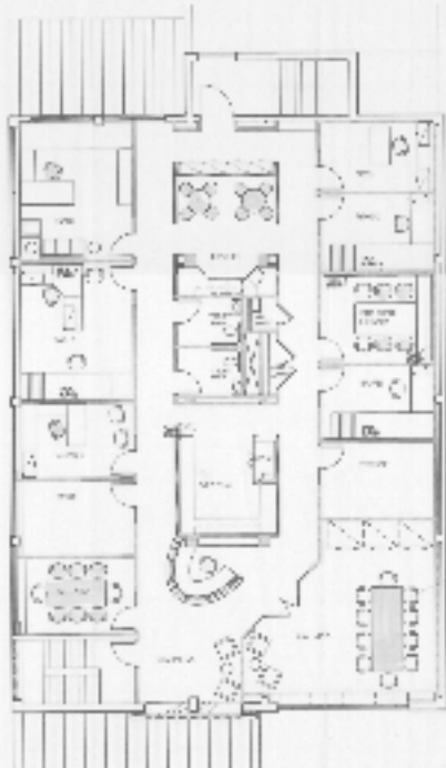
SECOND FLOOR PARTITION PLAN SCALE: 1/8" = 1'-0"