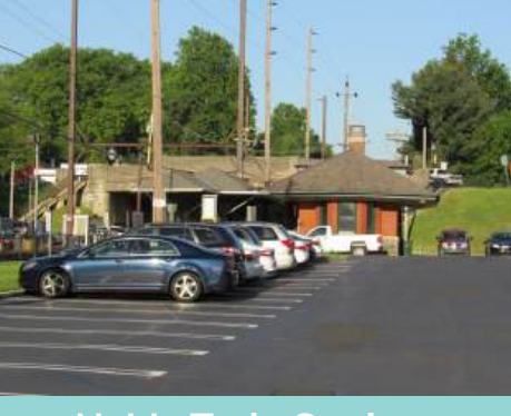
Noble Train Station