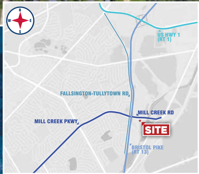
*Map not drawn to scale

As the exclusive agent for the ownership, Situs Properties is pleased to offer additional information or a personal site tour.