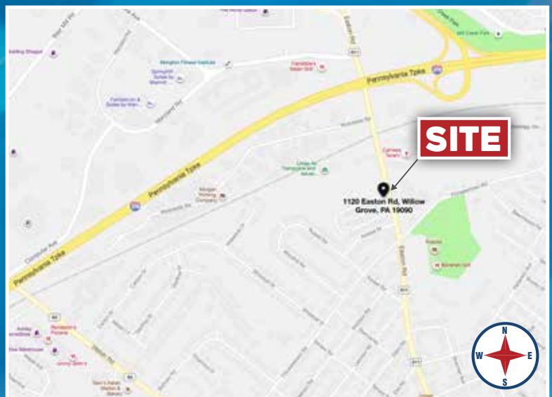
*Map not drawn to scale

As the exclusive agent for the ownership, Situs Properties, Inc. is pleased to offer additional information or a personal site tour.