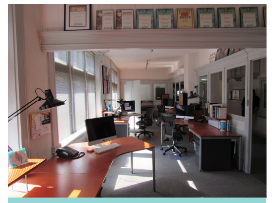
First Floor Bullpen