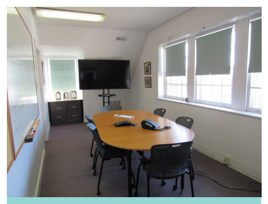
Second Floor Office