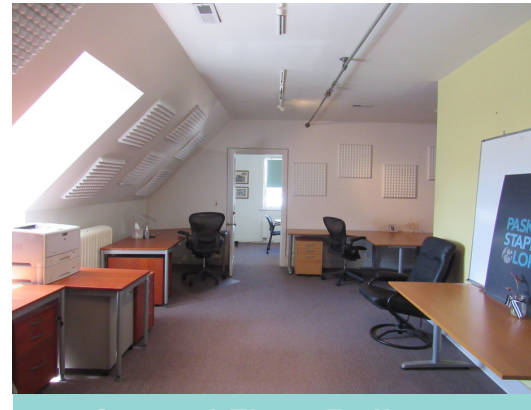
Second Floor Bullpen