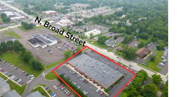
The foregoing information was furnished to us by sources which we deem to be reliable, but no warranty or representation is made as to the accuracy thereof. Subject to correction of errors, omissions, change of price, prior sale or withdrawal from market without notice.