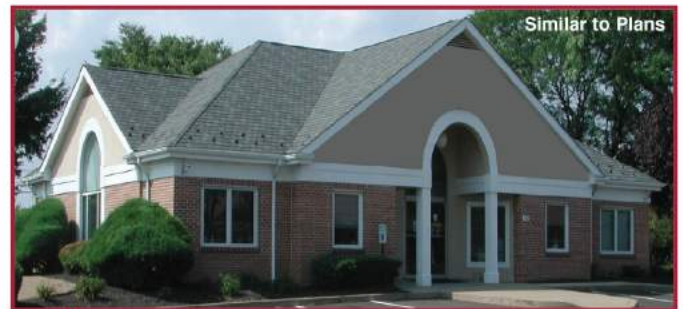
Similar to Plans