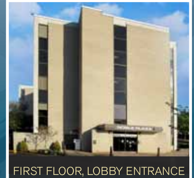
FIRST FLOOR, LOBBY ENTRANCE