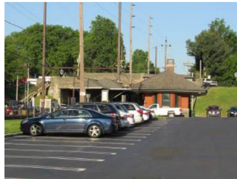
Noble Train Station