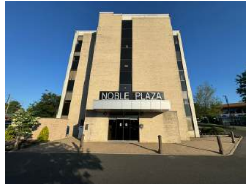
First Floor Lobby Entrance