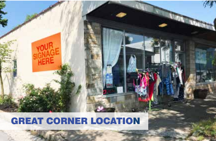
GREAT CORNER LOCATION