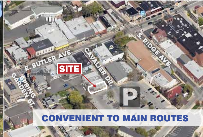
CONVENIENT TO MAIN ROUTES